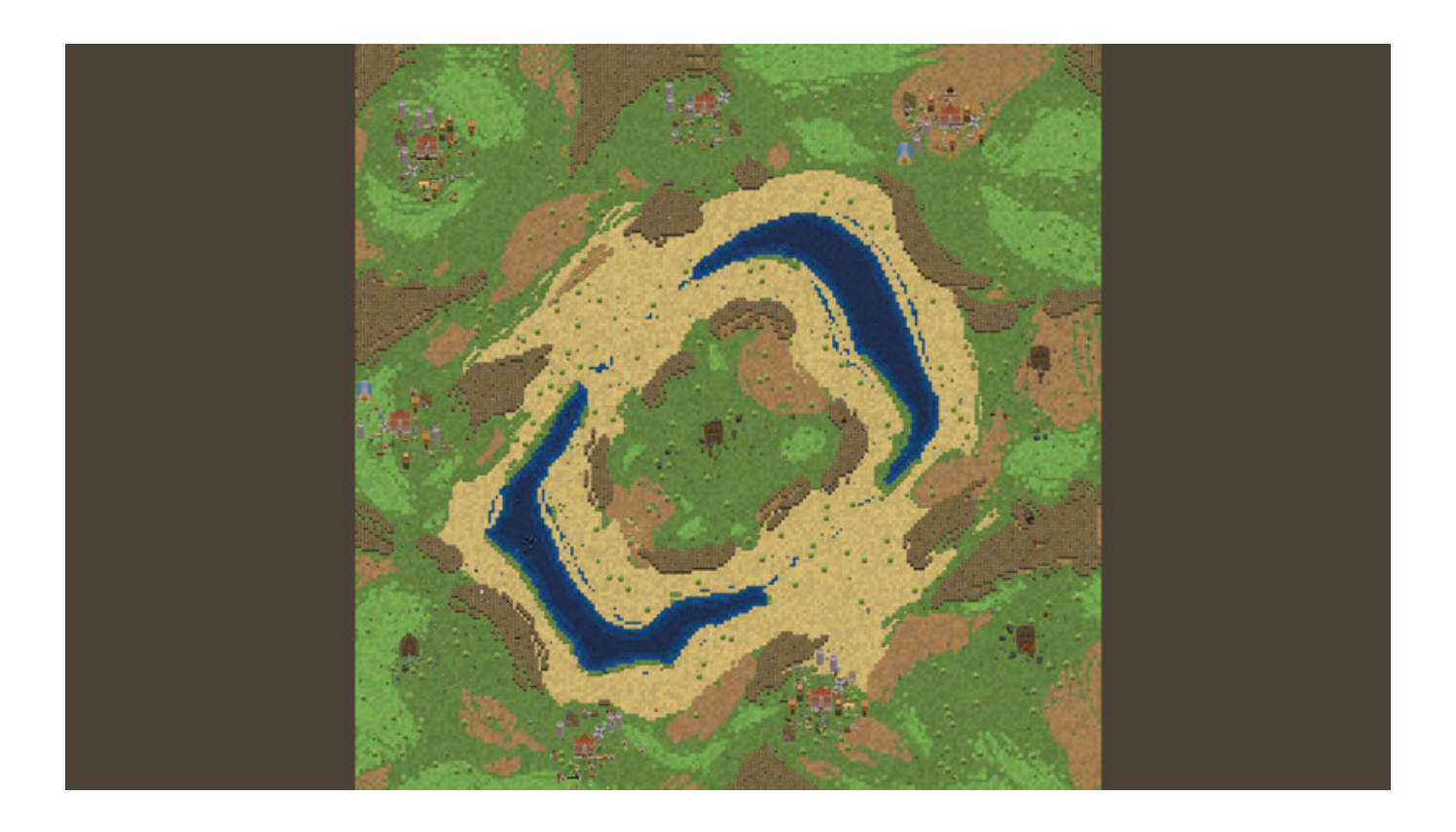
Download ->->-> <a href="http://bit.ly/2JoaN4T">http://bit.ly/2JoaN4T</a>